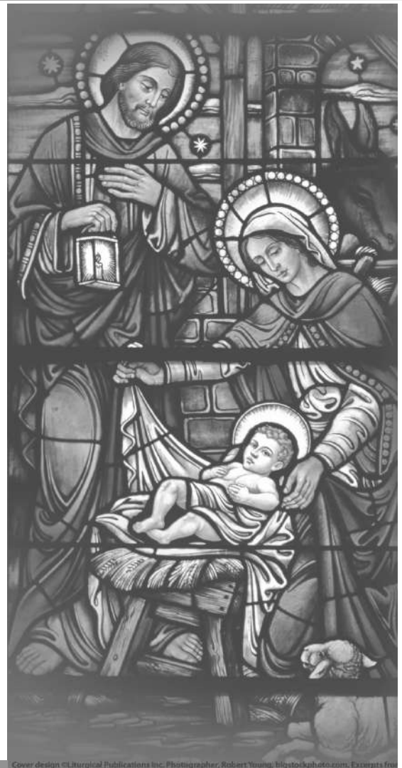
Excerpta from

There will be no 3:00 Confession or 4:30 Vigil Mass on Saturday, December 25 th . The Dec. 25 th , 9am Christmas Mass, does not fulfill your Sunday obligation.